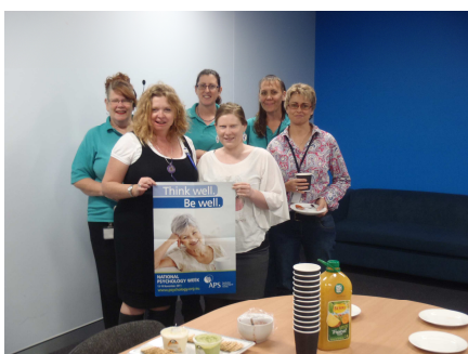
Centacare NENW staff recognising National Psychology Week

This program aims to promote and model respectful relationships for young people, to raise awareness about Domestic and Family Violence and Sexual Assault, to engage young people on the issues while challenging general stereotypes and to introduce young people to local service providers.